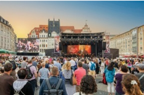
2025 Leipzig Bachfest "Transformation"