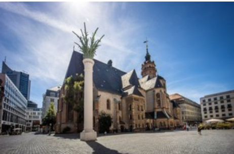
St Nicholas Church as the symbol for the Peaceful Revolution