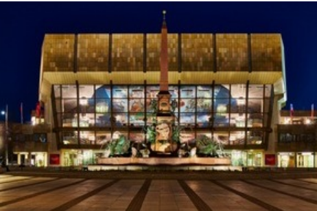
Shostakovich Festival at the Gewandhaus Concert Hall