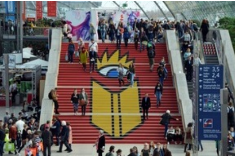
Leipzig Book Fair 2025