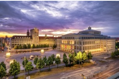
Oper Leipzig