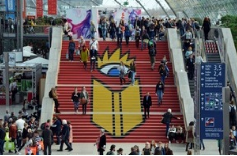
Leipzig Book Fair