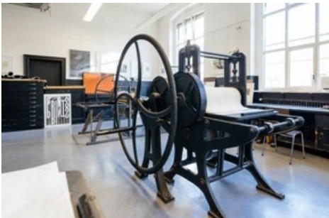
Explore Leipzig's artistic pulse at the HGB Academy, where the New Leipzig School, influenced by Neo Rauch, shapes the city's visual arts