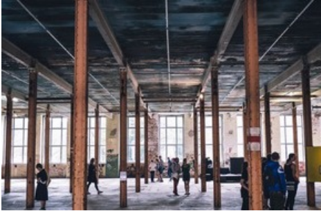
Exhibitions with industrial flair in Hall 14 at Spinnerei Art Centre in Leipzig, Plagwitz