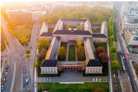
The Grassi Museum of Applied Arts stands as a vital institution for art and design

Diese Meldung kann unter https://www.presseportal.de/en/pm/70361/5670865 abgerufen werden.