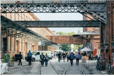
Explore Leipzig's creative heart at Spinnerei Art Centre – a vibrant hub with 14 galleries, over 100 studios, and contemporary art experiences.