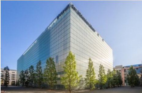
Uncover the stories of female artists in Leipzig's Museum of Fine Arts