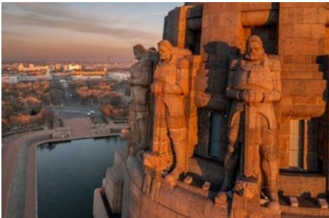
2) The Monument to the Battle of the Nations was erected in 1913 to commemorate the 100th anniversary of the battle