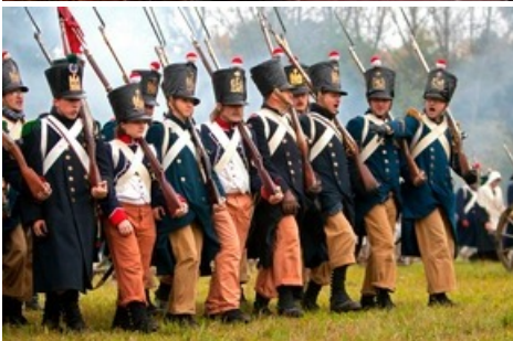
4) The historic Battle of the Nations is re-enacted every year in Leipzig

Diese Meldung kann unter https://www.presseportal.de/en/pm/70361/5650925 abgerufen werden.