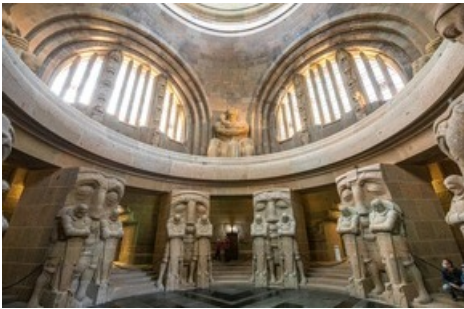
Monument of the Battle of the Nations crypt