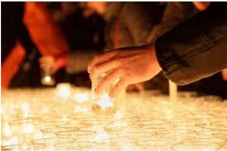
2 - Leipzig Peaceful Revolution of 1989 Festival of Lights