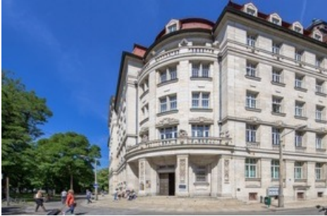
7 - Leipzig Memorial Museum in the Round Corner

Diese Meldung kann unter https://www.presseportal.de/en/pm/70361/5645500 abgerufen werden.