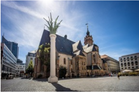
Heart of the Peaceful Revolution of 1989: St Nicolas Church in Leipzig