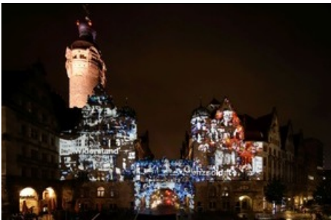
3 - Leipzig Festival of Lights 2023 New Townhall