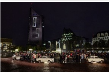
5 - Leipzig 9 October 2023 light project Trabi