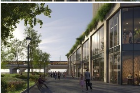
Entry area of the new IntercityHotel Rotterdam-Schiedam