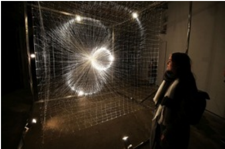
3) A look into the new exhibition