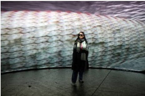
Dimensions - Digital Art since 1859 © Andreas Schmidt