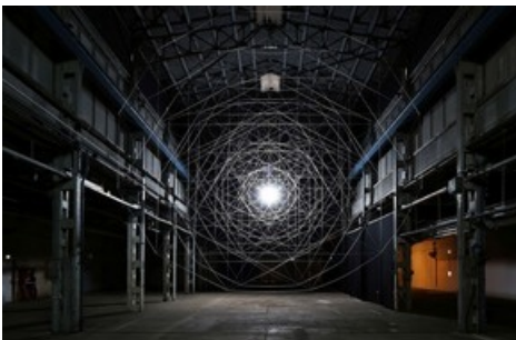
4) A look into the new exhibition