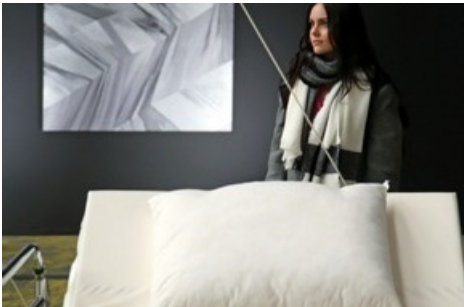
7) A look into the new exhibition