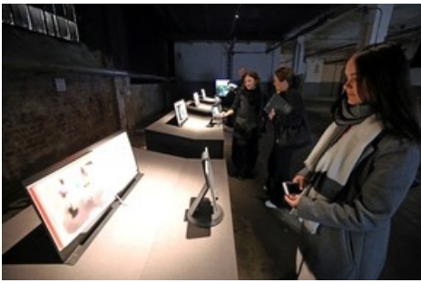
5) A look into the new exhibition