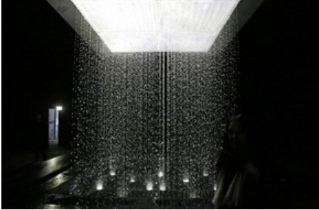
6) A look into the new exhibition