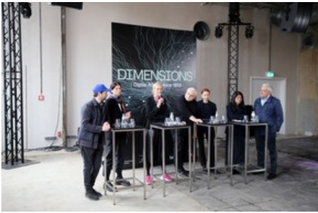
2) The organisers of the exhibition "DIMENSIONS" at the press conference