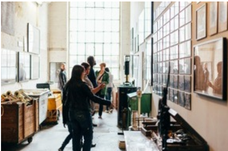
Leipzig Spinnerei on the site of a former cotton mill is home to many art galleries