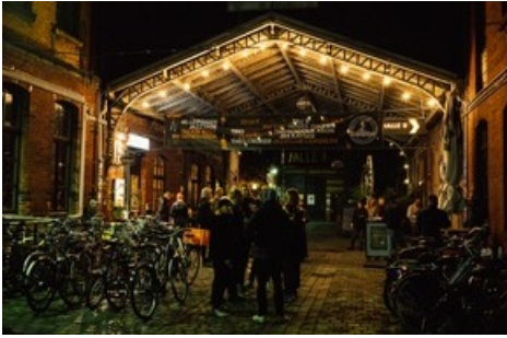
The Leipzig Jazz Days take place in various venues e.g. at Werk2 cultural center

Diese Meldung kann unter https://www.presseportal.de/en/pm/70361/5415162 abgerufen werden.