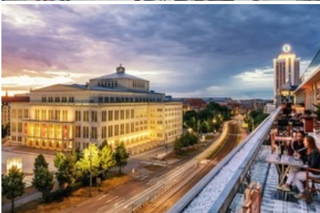
Having a good view from restaurant Felix to the Oper Leipzig on Augustusplatz