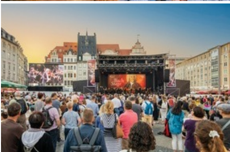
Bachfest Leipzig - visitors at BachStage on the Leipzig Marketplace