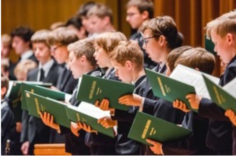
The city of music Leipzig is proud of its Thomanerchor - St Thomas Boys' Choir founded in 1212