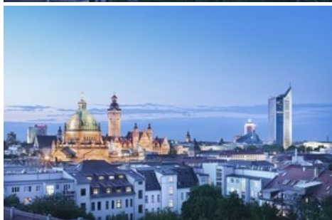
The panorama of Leipzig shows St Thomas' Church, the Federal Administrative Court, the New Town Hall, St Nicholas' Church, the University, the Winter Garden high-rise and the Panorama Tower (from left)