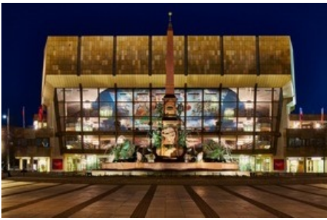
Gewandhaus Concert Hall Leipzig is home to the famous Gewandhausorchester