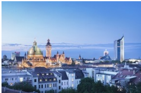
Panoramic view of Leipzig city center