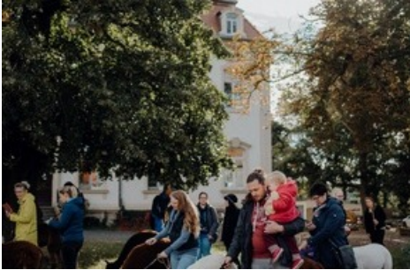
There are plenty of thematic tours like a walk with llamas and alpacas.

Diese Meldung kann unter https://www.presseportal.de/en/pm/70361/5178291 abgerufen werden.