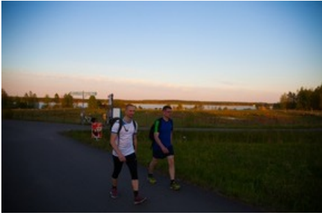
From 6-8 May 2022 hiking friends can participate at the 7 Lakes Hike in the Leipzig Region.