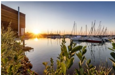
The hiking options are as diverse as the lakes around Leipzig itself - for example Störnthaler Lake.