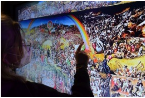
Tübke Touch was realised in cooperation with Centrica, a company based in Florence, Italy. © Maike Makowka