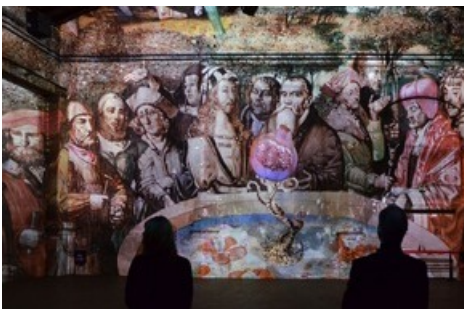
Das Kunstkraftwerk Leipzig präsentiert mit "Tübke Monumental" die deutsche Kunstgeschichte auf eine neue Art und Weise