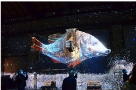
Tübke worked on his masterpiece for 11 years, drawing inspiration from well-known works