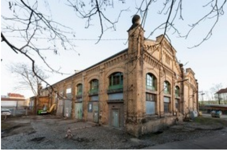
The former heating plant in the Plagwitz district has developed into a centre for digital art within a short space of time.

Diese Meldung kann unter https://www.presseportal.de/en/pm/70361/5174209 abgerufen werden.