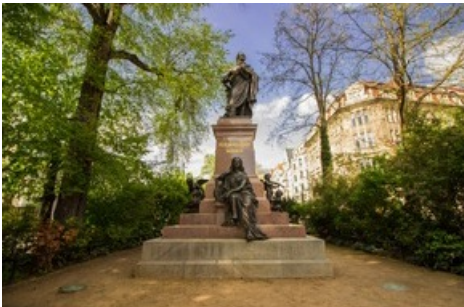
The Mendelssohn Monument in Leipzig's city centre commemorates one of the city's most famous composers.

Diese Meldung kann unter https://www.presseportal.de/en/pm/70361/5145791 abgerufen werden.