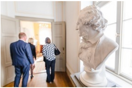
The Mendelssohn House is the only still existing home of the composer Felix Mendelssohn Bartholdy.