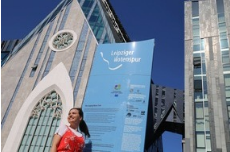
The Leipzig Music Trail (Notenspur Leipzig) celebrates 10th anniversary and looks forward to an eventful year 2022.