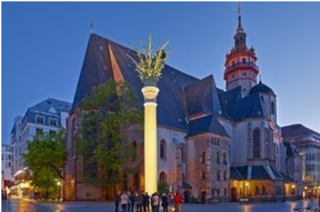
Central starting point of the 1989 Peaceful Revolution: St. Nicholas Church Leipzig with St. Nicholas Churchyard