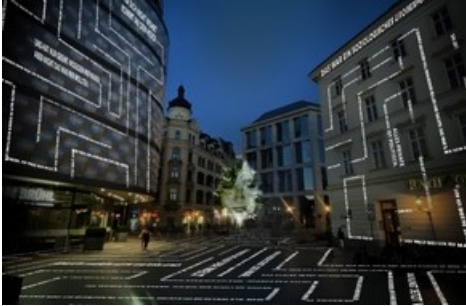
Leipzig Festival of Lights 89votes

Diese Meldung kann unter https://www.presseportal.de/en/pm/70361/5037997 abgerufen werden.