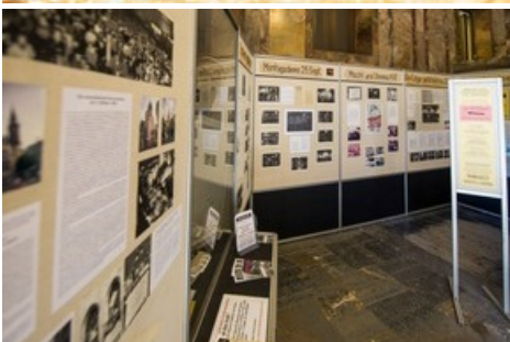
Leipzig Museum Round Corner Peaceful Revolution