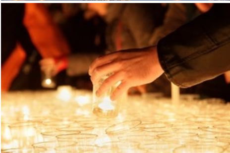
Leipzig Festival of Lights candles