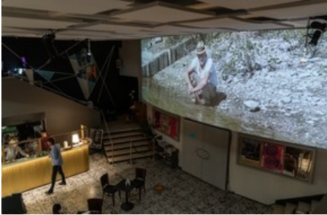
Didi Müller, REFLECTION OF THE PROJECTION - Ein Kontemplationsraum, 2021 © ZKM | Center for Art and Media Karlsruhe, Photo: Elias Siebert / Editorial use of this picture is free of charge. Please quote the source: "obs/ZKM Karlsruhe"