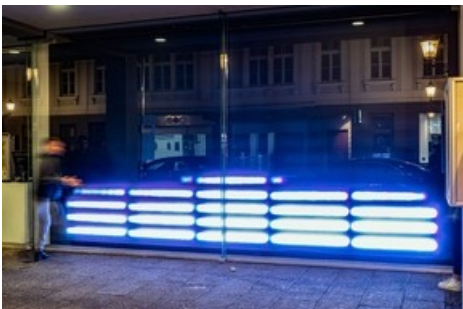
Peter Weibel, Klangkanal , 2012/2019/2021 © Photo: ARTIS-Uli Deck / Editorial use of this picture is free of charge. Please quote the source: "obs/ZKM Karlsruhe/ARTIS - Uli Deck"