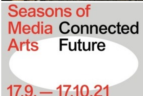
Seasons of Media Arts, 2021, / Editorial use of this picture is free of charge.

Original content of: ZKM , transmitted by news aktuell