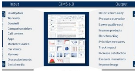
Fig. 1: CIMS 6.0 - AI-supported Big Data Platform of Consline AG. Editorial use of this picture is free of charge. Please quote the source: "obs/Consline AG"

45 6.0: High API/AI/HI process integration for unique 4C Content Insights - result of Consline AG's 20 years of experience in Big Data Analysis