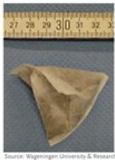
Tea bag (paper/PLA) before composting