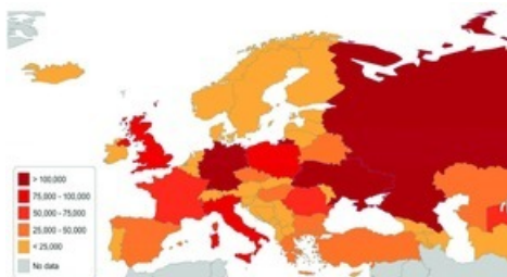
Abb. 2 Ernährungsbedingte Todesfälle durch Herz-Kreislauf-Erkrankungen in der Europäischen Region im Jahr 2016 (Diet-related deaths from cardiovascular diseases in the European Region in 2016)

Diet-related deaths from cardiovascular diseases in the WHO European Region in 2016 / Editorial use of this picture is free of charge. Please quote the source: "obs/nutriCARD"