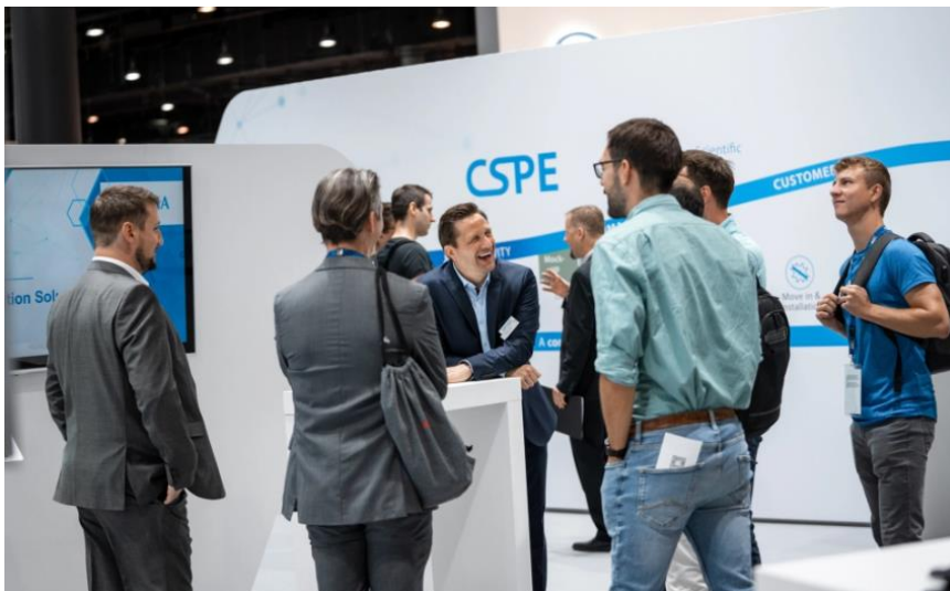
Optima presents new technologies for filling solutions, isolators, and freeze-drying at ACHEMA 2024.

From June 10-14, 2024 Optima will be at ACHEMA in Frankfurt am Main. At the world's leading trade show for the process industry, the packaging and filling equipment provider will present its complete, integrated turnkey solutions for the pharmaceutical and biotech industries. Visitors at the booth A73 in hall 3.0 will get an exclusive look at a highly flexible MultiUse system with isolator, the sterility test isolator STISO, and the new LYO-SCALE freeze dryer for scale-up processes.