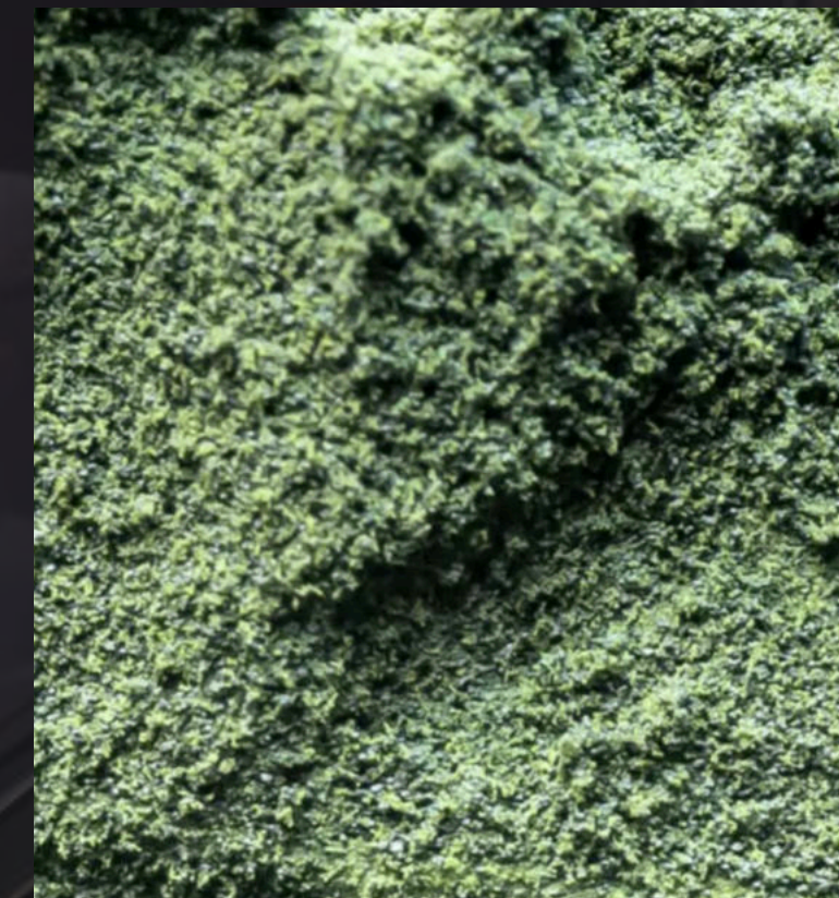
Algae Powder (Heating process creates raincoat fabric)