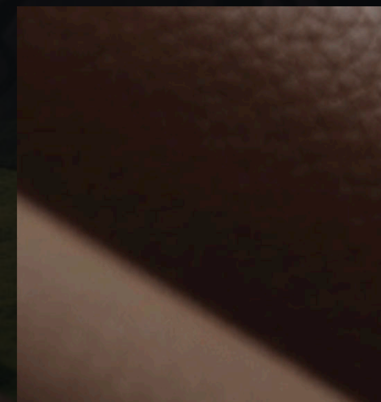
Mirum® Leather (plant-based and plastic-free)