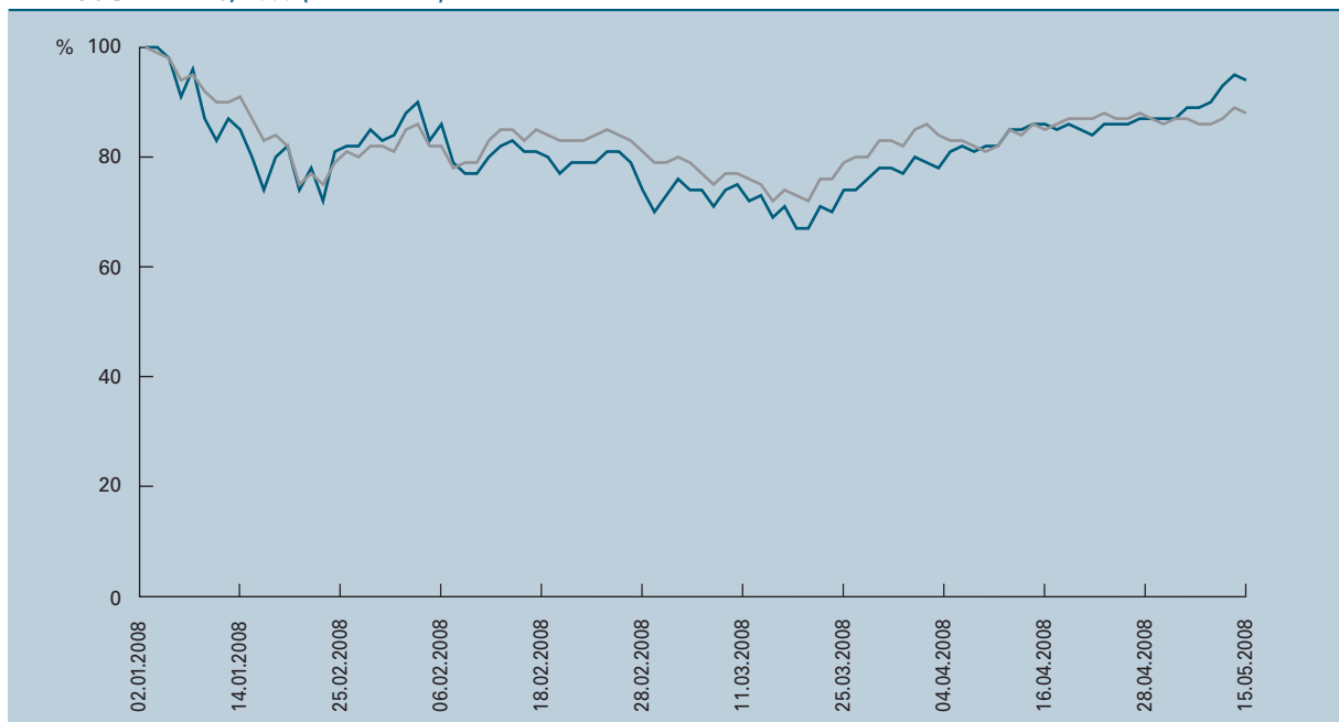
PERFORMANCE OF NORDEX STOCK RELATIVE TO THE TECDAX FROM JANUARY 1, 2008 THROUGH MAY 15, 2008 (INDEX-TIED)