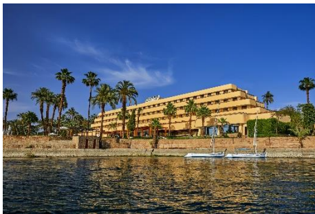
Steigenberger Resort Achi on the Nile in Luxor