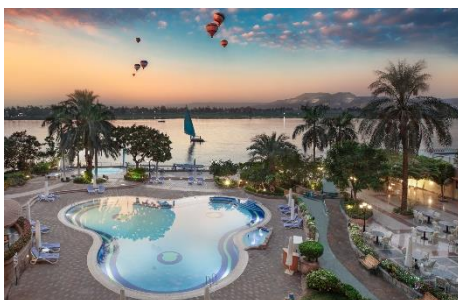
Steigenberger Nile Palace with hotel jetty and panoramic view of the Nile