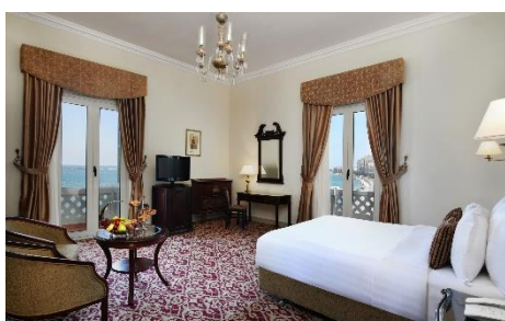
Junior Suite Steigenberger Cecil Hotel

Current press information is available in our press portal .