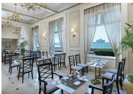
Restaurant in the Steigenberger Cecil Hotel with view of the Mediterranean