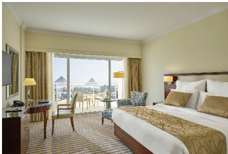
Deluxe room Steigenberger Pyramids Cairo with view of the Pyramids of Giza

For further information and booking, please see: www.hrewards.com