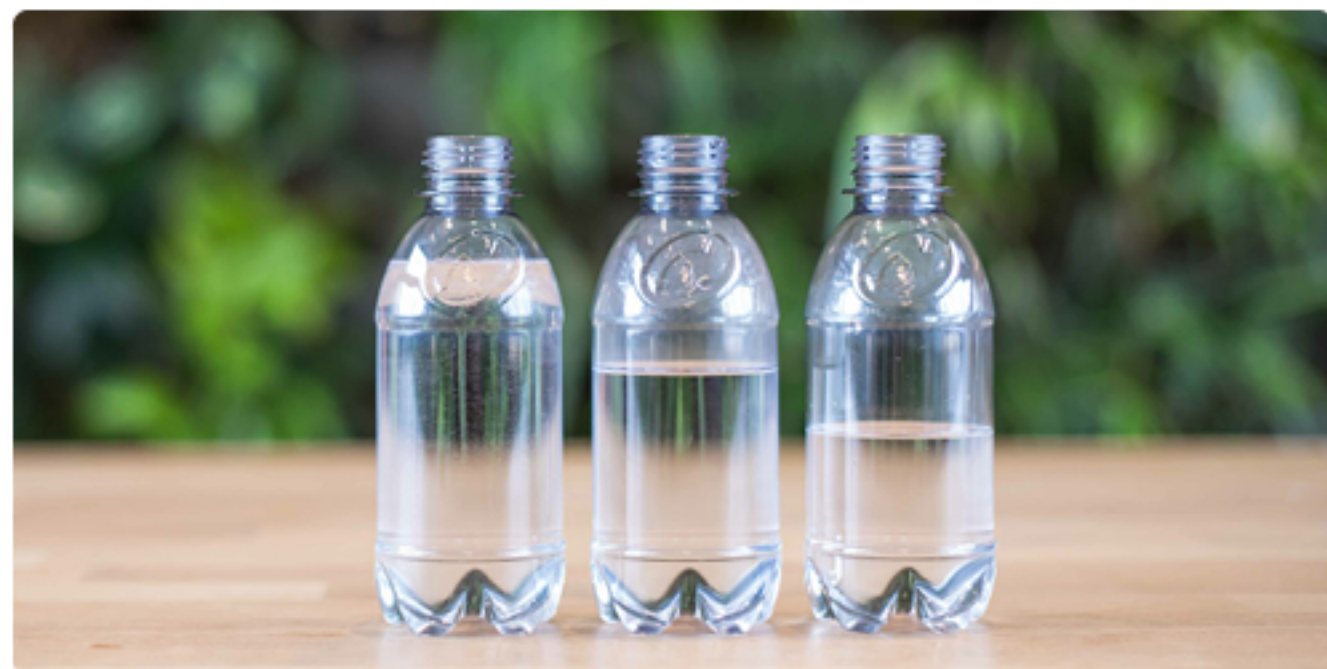
Monolayer PEF Bottle: a High-Quality and Sustainable Packaging Material Avantium Renewable Polymers (NL)