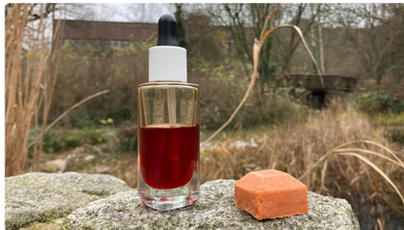
Carbon-Light Yeast Oil COLIPI (DE)