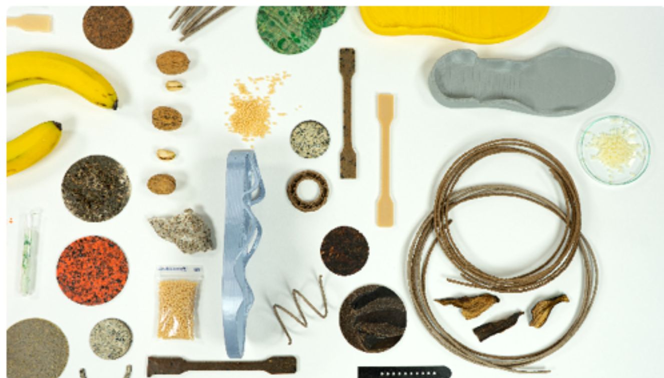
KUORI – Bio-based and Biodegradable Elastic Materials KUORI (CH)