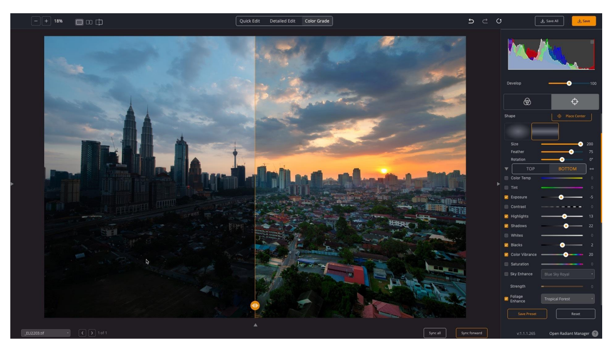
Radiant Photo's Graduated Filter allows adjustments to specific portions of your photos. For example, you can apply a radial gradient – to add stylistic vignettes – or linear gradients – affecting just the top and bottom of the image, perfectly bringing out the sunset in this shot.