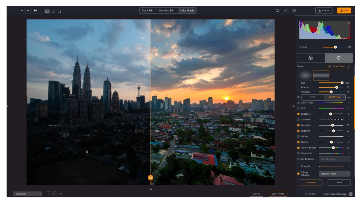
Radiant Photo offers three modes: Quick Edit which includes powerful auto-enhancements and only a few sliders to adjust, Detailed Edit with all manual controls, and Color Grade for a more creative take on the image.

INDIALANTIC, FL - April 17, 2023 — Radiant Photo uses smart image analysis and applies changes on a pixel-by-pixel basis without over-processing photos. Whether photographers rely on Radiant Photo's automatic enhancements and use batch processing or love to tweak the software's suggestion manually for every image - great results and editing speed are paramount. The new update 1.1.1 which is now shipping delivers improvements in three areas, all of which make processing your images faster than ever: batch processing, performance boosts, and color grading.