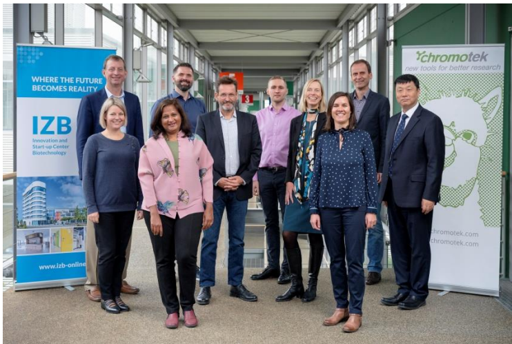
Foto ChromoTek- und Proteintech-Team