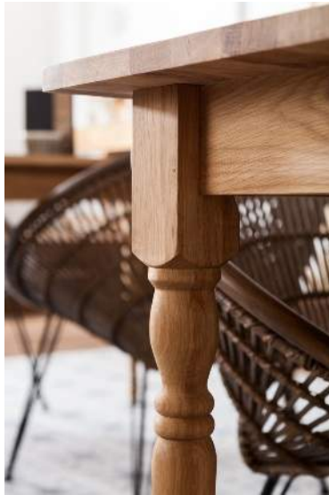
Collection French Bistro